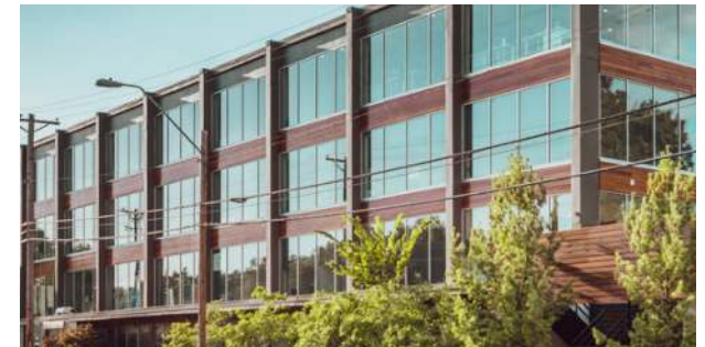
Brookside Professional Building