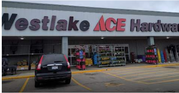
Ace Hardware - Raytown