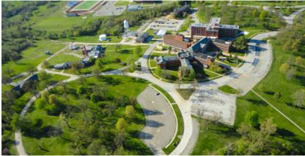
Mount Vernon Campus