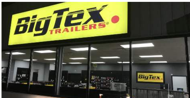
Big Tex Trailers