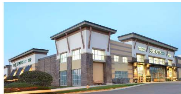
Nall Hills Shopping Center