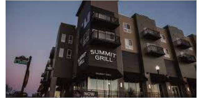
Summit Grill - Gladstone