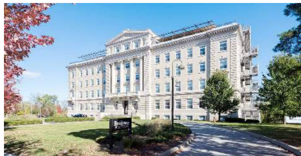
Residents at West Paseo