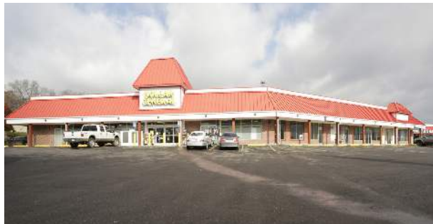
603 Front St