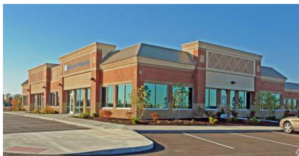
Frontier Medical Center