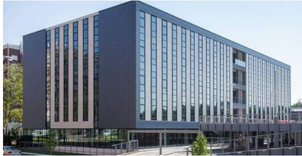
301 E Armour