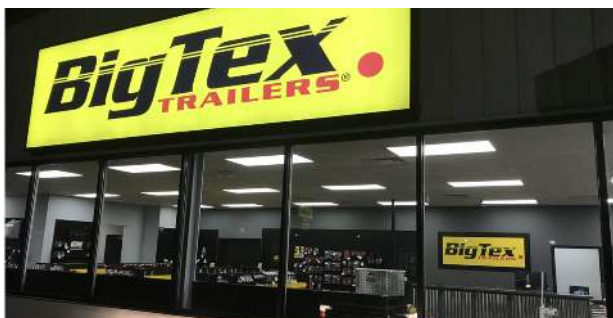
Big Tex Trailers