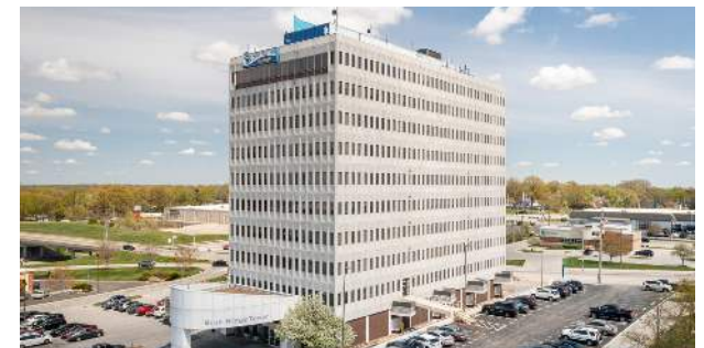
Blue Ridge Tower