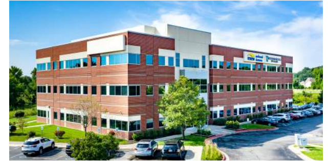
Pointe De Bleu