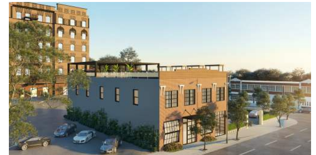
1523 Oak St