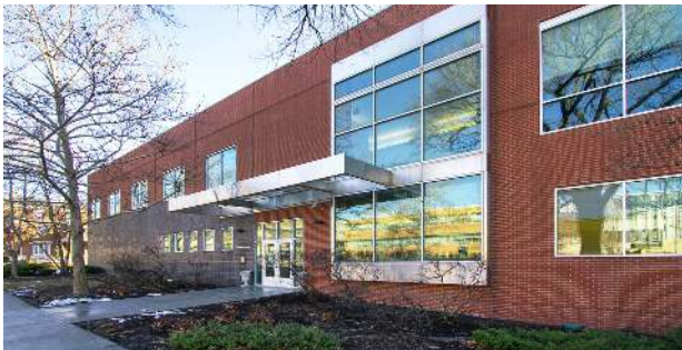
1 East Armour