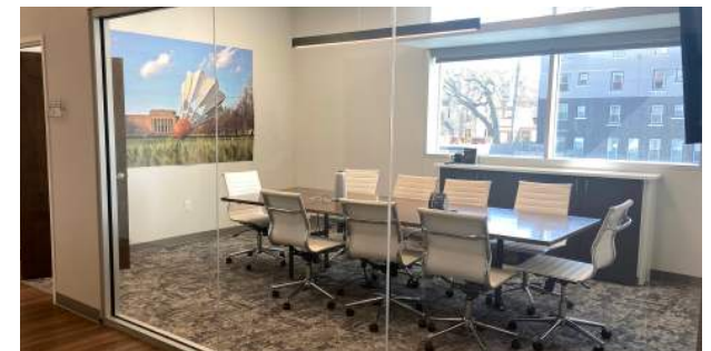
1 East Armour Blvd