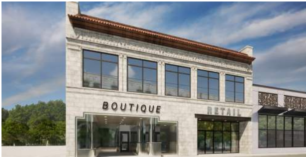
Original Helzberg Building