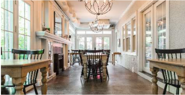
Southmoreland on the Plaza