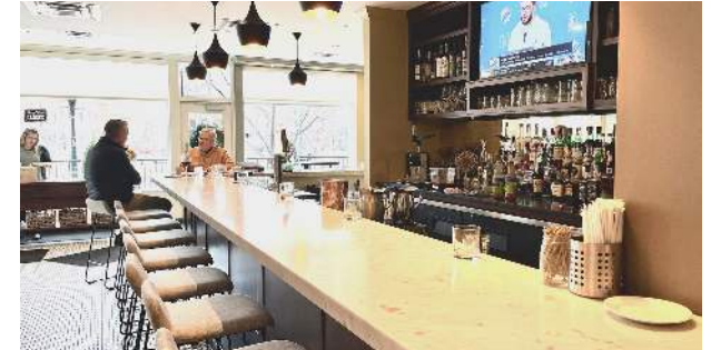
Union on the Hill Cafe