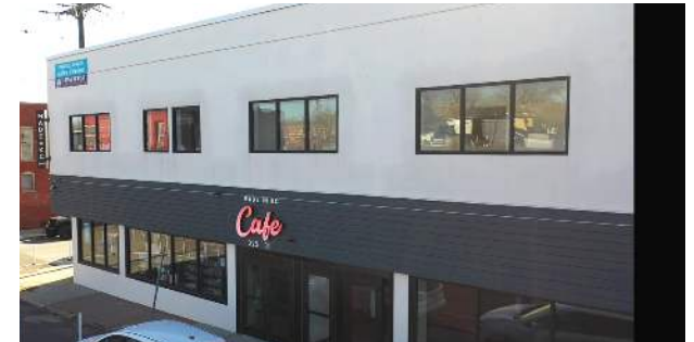
Martini Corner Renovation