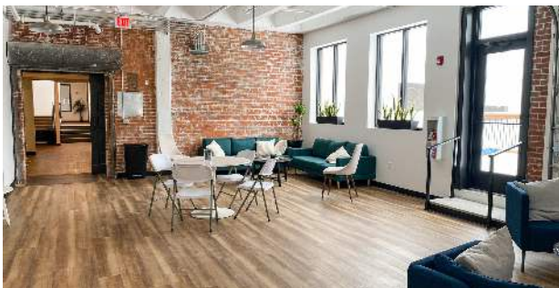
325 E 31st St